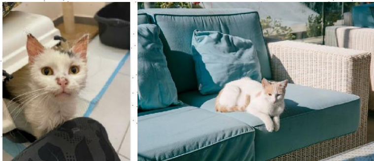
Photo 14 & 15 Cats are part of our everyday routine