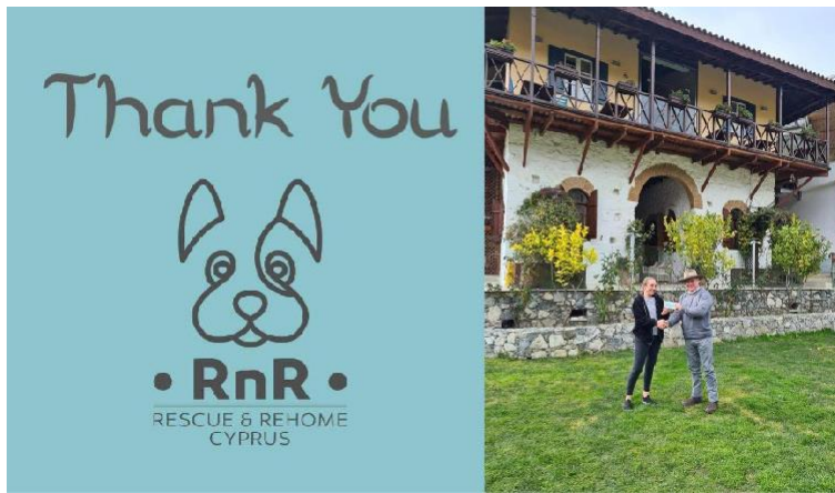
Photo 13. Donation to RnR Cyprus dog shelter