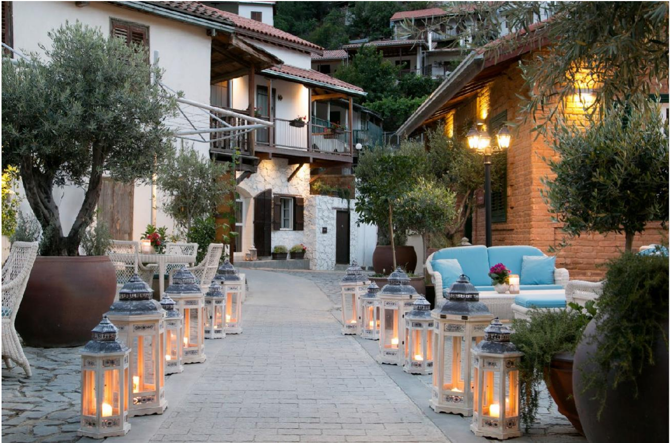
Photo 3. Casale Panayiotis main entrance

Now with 41 rooms in 7 houses across the village, as well as cafes and restaurants, villagers have been inspired to invest in their own community, restoring their homes and opening small businesses preserving our mountain culture and way of life.