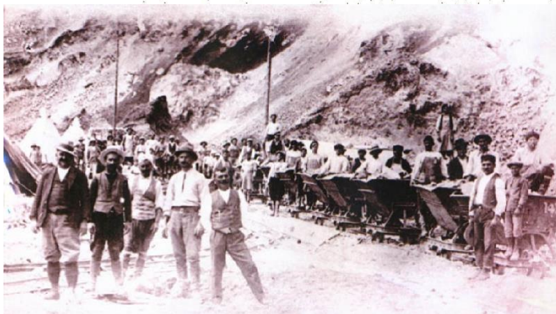
Photo 2. Group photo of Kalopanayiotis residents