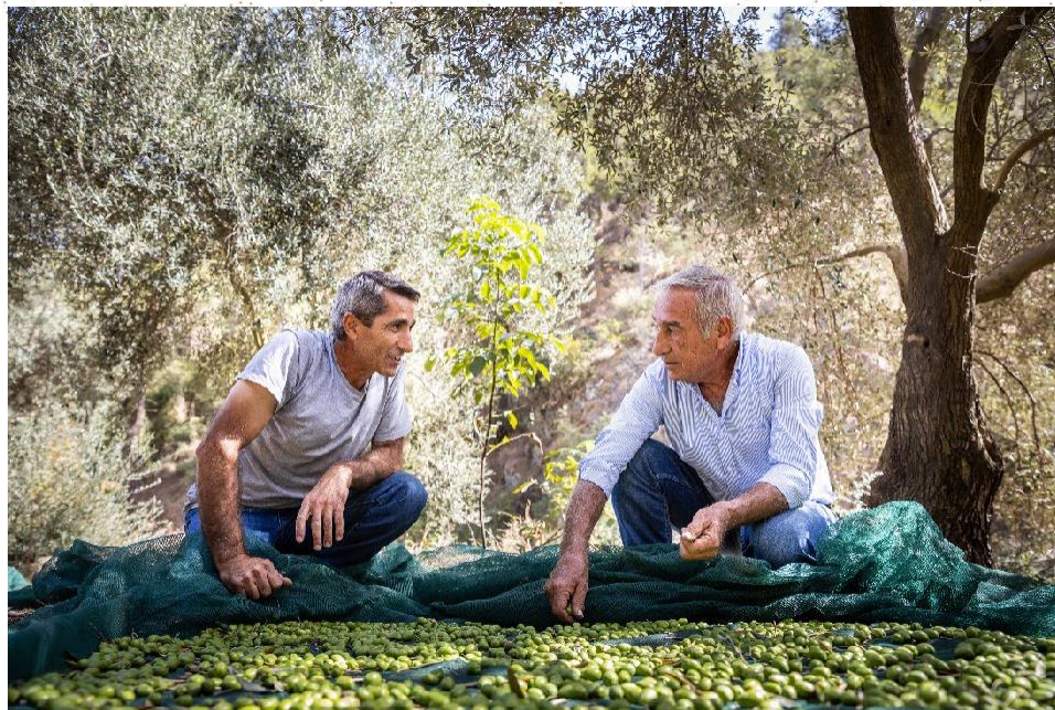
Photo 5. Our own orchard which supplies the hotel with fresh fruits and vegetables.

(All seasonal fruit and vegetables come directly from our orchards, and we source our ingredients from local mountain producers wherever possible).