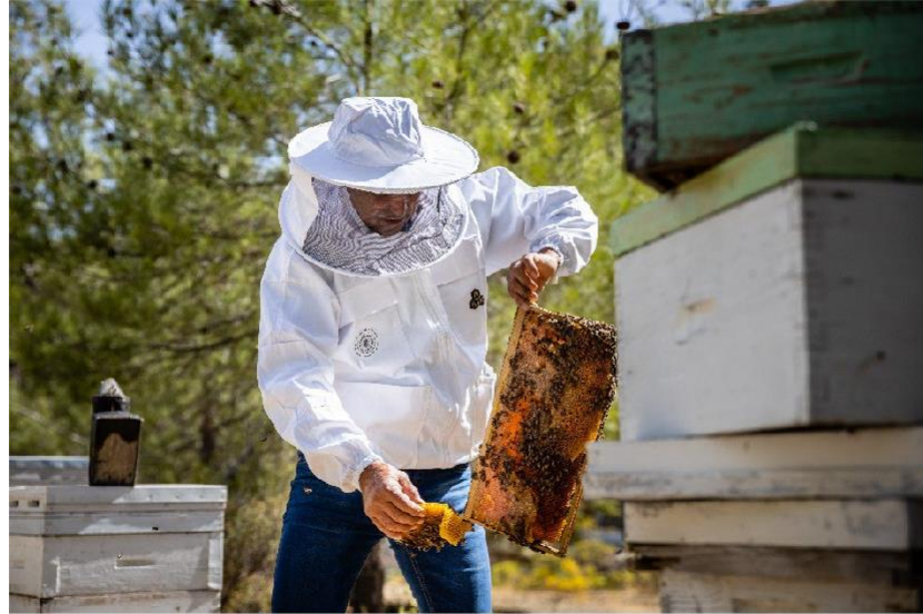
Photo 12. Beekeeping